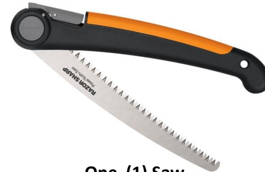
One (1) Saw