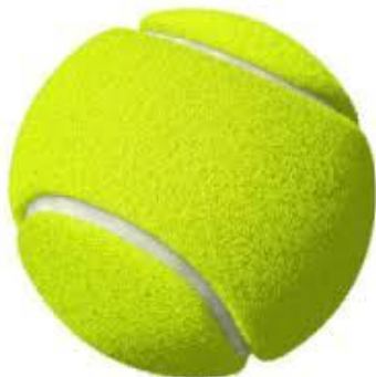
Four (4) Tennis Balls with a small "X" cut on bottom