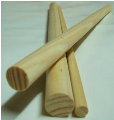
Four (4) Wooden Dowels 4' high