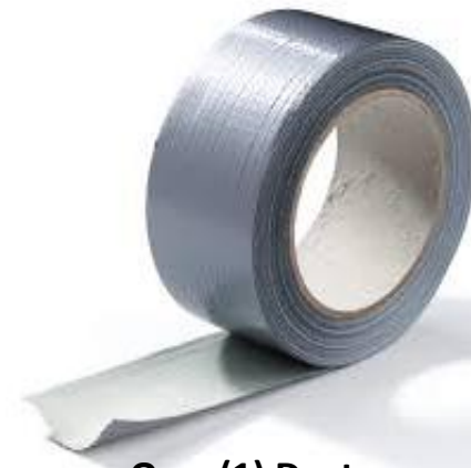
One (1) Duct